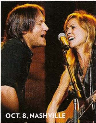
OCT. 8, NASHVILLE

OCT. 19 Kidman is back in the U.S. with Urban as he checks into rehab; her Oct. 21 press conference for Fur is canceled.