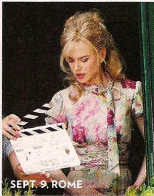
SEPT. 9, ROME