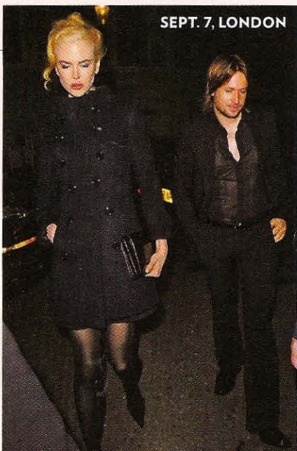
SEPT. 7, LONDON