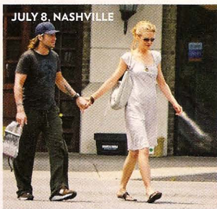
JULY 8, NASHVILLE